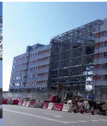
CASL Aircraft Maintenance Hanger 中國飛機服務有限公司機庫建築工程