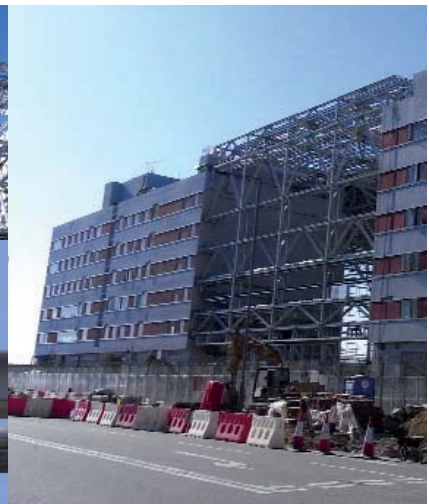
CASL Aircraft Maintenance Hanger 中國飛機服務有限公司機庫建築工程