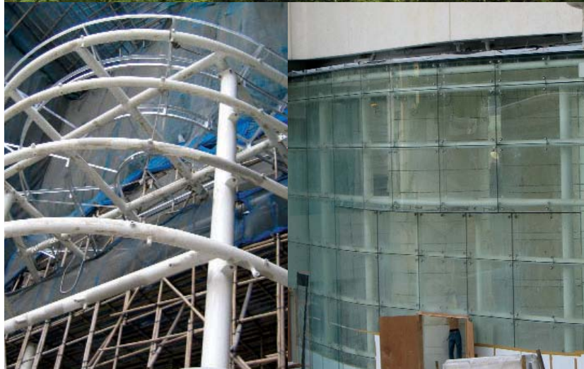
Residence Bel-Air ,Cyber Port R5 貝沙灣 數碼港 R5

Main Contractor: Paul Y. General Contractors Ltd. 保華建築營造有限公司