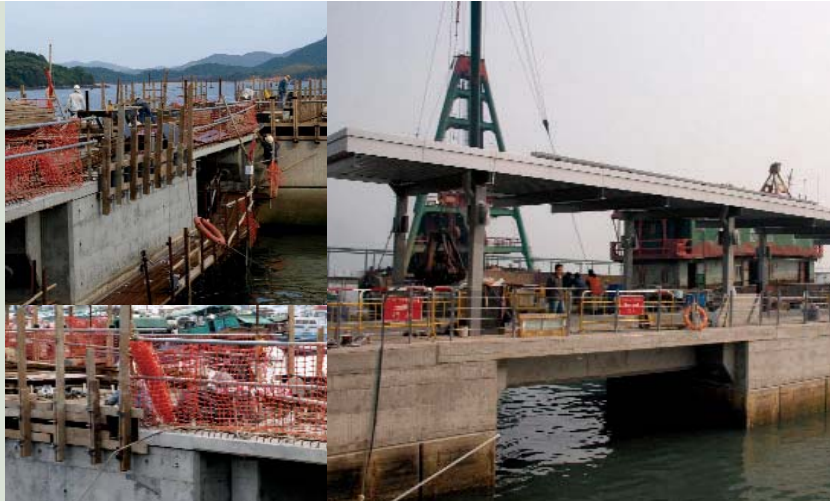
Sai Kung Public Pier No. 2 (CV/2005/015) 西貢二號公眾碼頭